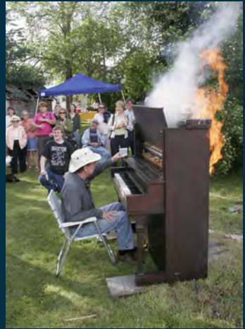
Piano Burning at the Roxbury Tavern by Reece Donihi

Photo Exhibit by the Center of Photography